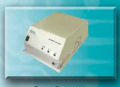
Battery Backup Unit