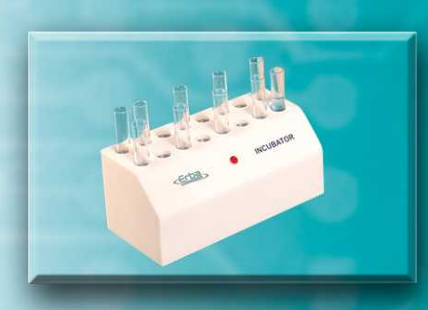
16 Position Dry Block Incubator