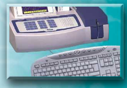
PC Keyboard Interface