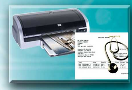
Direct Patient Result Reporting